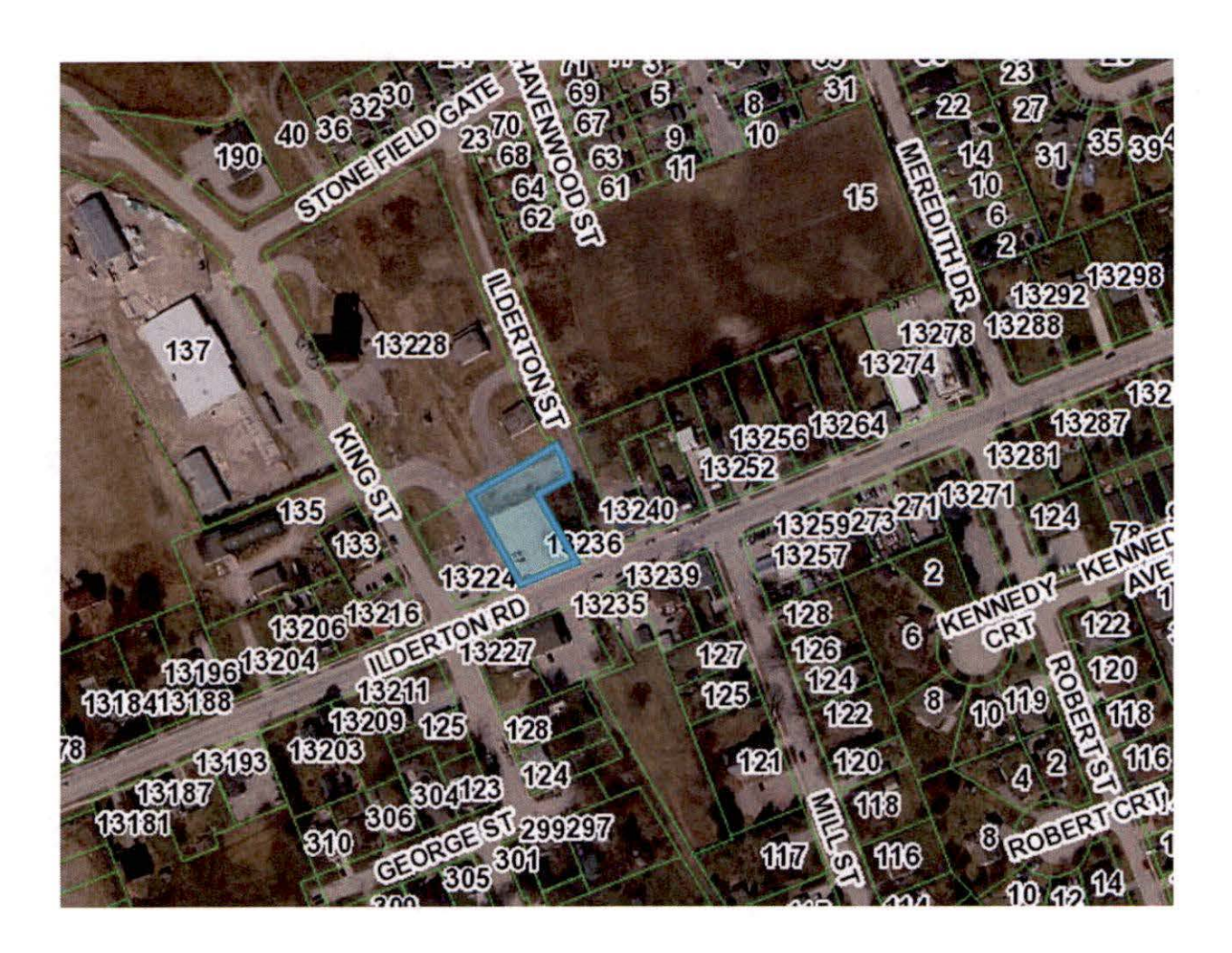
Schedule 10 - Unmetered Off-Street Municipal Parking Lots